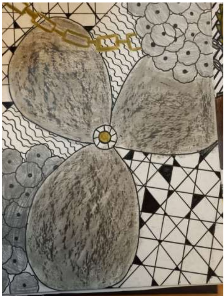
Year 6 machine inspired art.