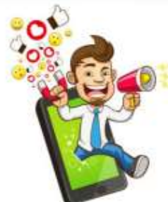
A Parent's Guide to Live Streaming