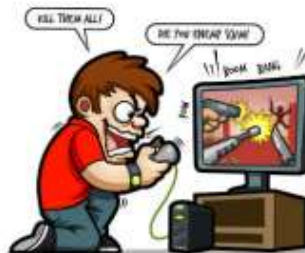
A Parent's Guide to Gaming