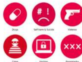
A Parent's Guide to Privacy Settings

Online safety is when young people know who they can tell if they feel upset by something that has happened online.