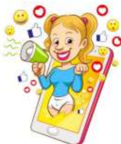
A Parent's Guide to Online Influencers