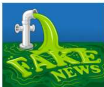
A Parent's Guide to Fake News