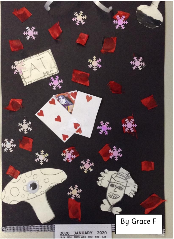
By Grace F

Year 6 have been making these fantastic Victorian inspired calendars. They have used a simple three colour scheme to achieve some amazing results. They will be going home for Christmas and adorning fridges and cupboards for 2020.