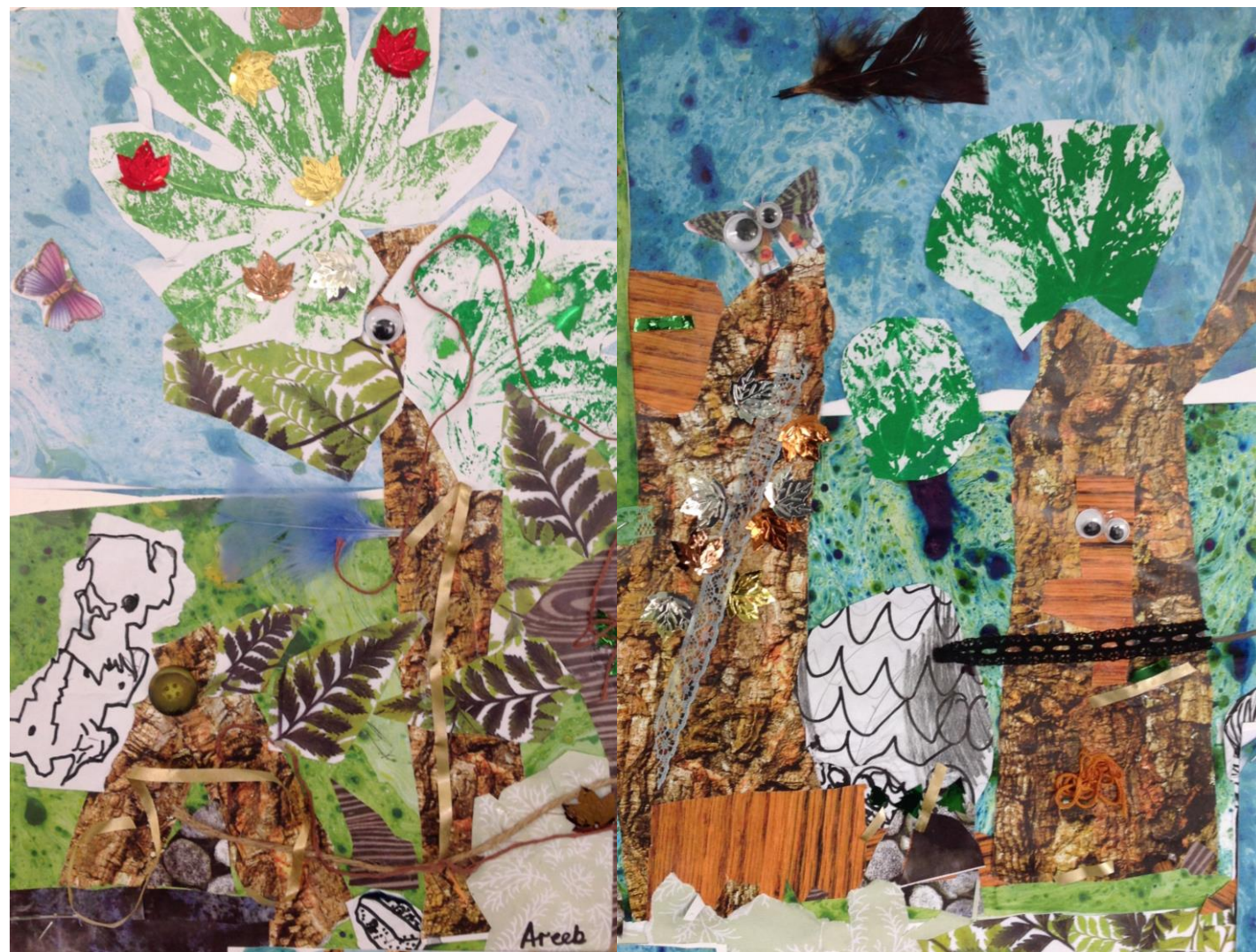
Top left: Areeb